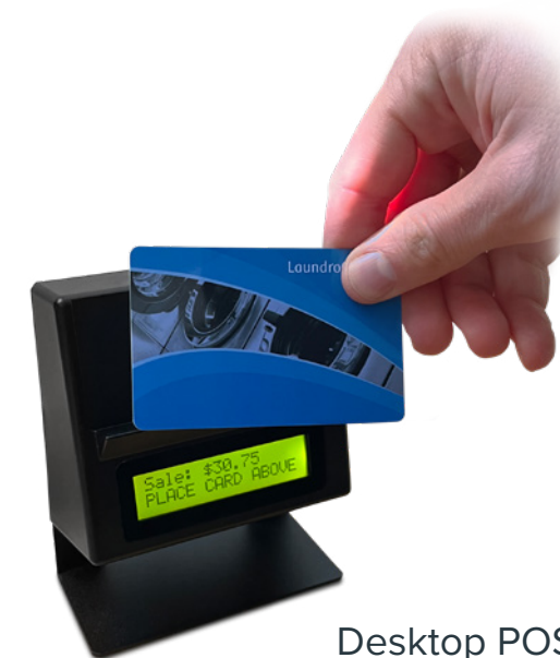
Desktop POS reader