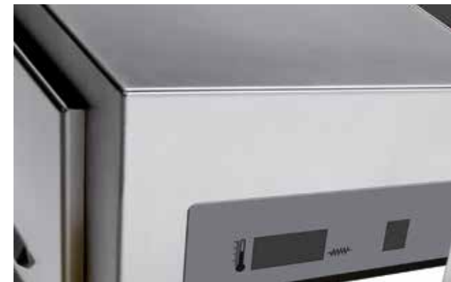
STAINLESS FINISH Panels in stainless steel and lacquered steel.

Humidity control which adapts the roll speed depending on the moisture of the flatwork.