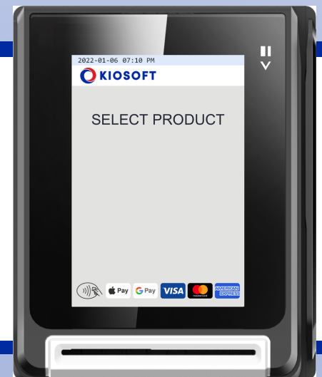
VXT Series Reader

* QR code based transactions do not use Bluetooth. Works with Internet-connected machines only.