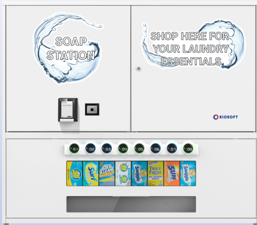
Model: VLA-DULT-03 Dimensions: 47.2" W x 10.2" D x 40.9" H Capacity : 184