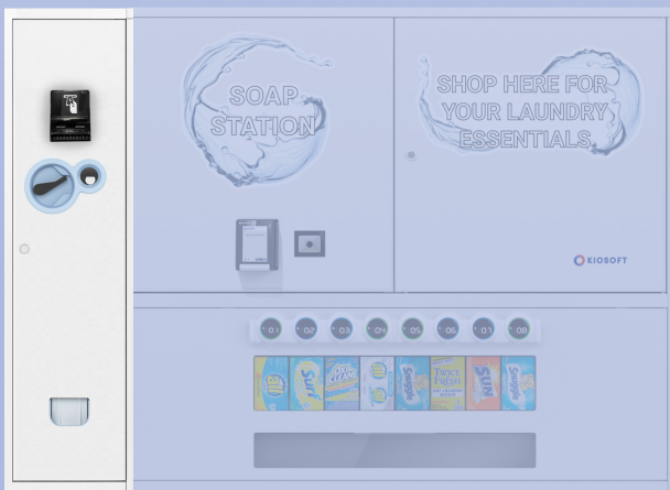
Model: VLA-DULT-04 Dimensions: 6.3" W x 10.2" D x 40.9" H